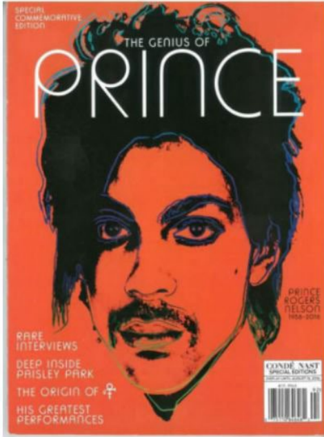
2016 Vanity Fair Cover