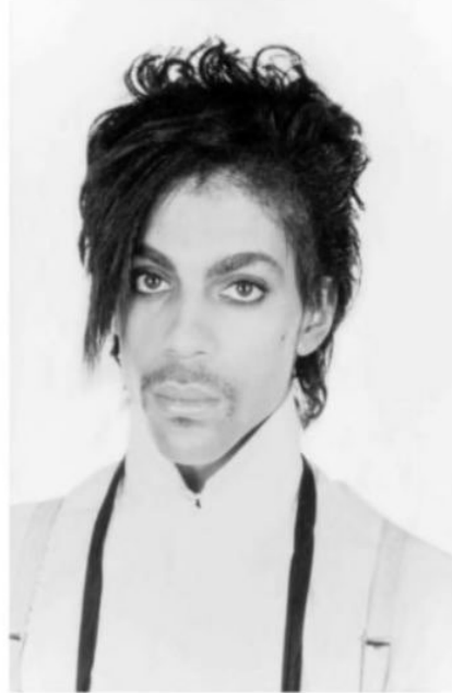
1981 Goldsmith Photo

Background: In 1981, Newsweek hired photographer Lynn Goldsmith to photograph Prince (right). Vanity Fair later commissioned Andy Warhol to create an image for the magazine based on Goldsmith's photo. Warhol also created 15 other works in a "Prince Series." After Prince's death in 2016, Vanity Fair published a piece from the series (left) without compensating Goldsmith.